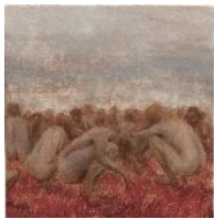
Untitled, 2020 Oil on Wood 9 1/2" x 9 1/4" (24.1 x 23.5 cm) Signed and Dated Verso in Ink RYT.22522