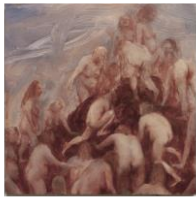
Untitled, 2020 Oil on Panel 8" x 8" (20.5 x 20.5 cm) Signed and Dated Verso in Pencil RYT.22530