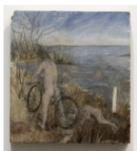
Untitled, 2020 Oil and Graphite on Wood 6 1/8" x 5 5/8" (15.5 x 14.5 cm) Signed and Dated Verso in Ink RYT.22527