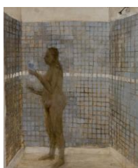
Untitled, 2018 Oil on Canvas Image: Approximately 27" x 22" (68.5 x 56 cm) Signed and Dated Verso in Pencil RYT.22501