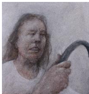
Untitled, 2021 Oil on Wood 9 1/8" x 8 3/4" (23 x 22 cm) Signed and Dated Verso in Pencil RYT.22595