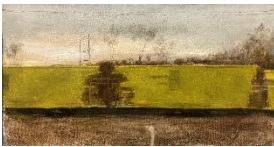
Untitled, 2021 Oil on Canvas 7 1/4" x 13 1/2" (18.5 x 34.5) Signed and Dated Verso in Pencil RYT.22600