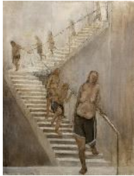
Untitled, 2020 Oil and Graphite on Canvas 38 1/4" x 30 1/8" (97 x 76.5 cm) Signed and Dated Verso in Pencil RYT.22514