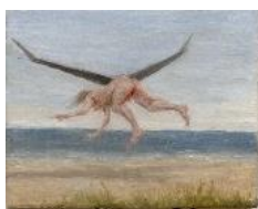
Untitled, 2021 Oil on Wood 3 1/2" x 4 3/16" (8.9 x 10.6 cm) Signed and Dated Verso in Pencil RYT.22533