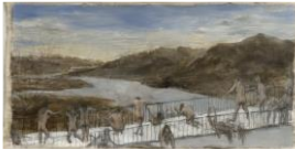
Untitled, 2021 Oil on Canvas Image: Approximately 16" x 36" (40.5 x 91.5 cm) Signed and Dated Verso in Pencil RYT.22502