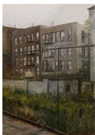
Untitled, 2021 Oil on Canvas 15 3/8" x 10 3/4" (39 x 27.5 cm) Signed and Dated Verso in Pencil RYT.22594d