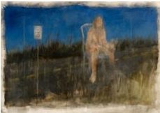
Untitled, 2018 Oil on Canvas Image: Approximately 24" x 37" (61 x 94 cm) Signed and Dated Recto in Ink: Signed and Dated RYT.22505