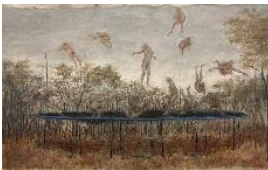
Untitled, 2021 Oil on Canvas 36 7/8" x 60 1/8" (93.5 x 152.5 cm) Signed and Dated Verso in Pencil RYT.22596d