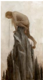
Untitled, 2020 Oil on Canvas 39 1/4" x 21 1/4" (99.5 x 54 cm) Signed and Dated Verso in Pencil RYT.22515