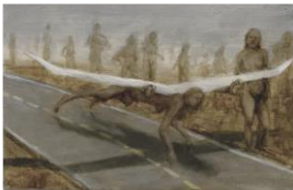
Untitled, 2020 Oil on Wood 7 1/4" x 11 1/4" (18.5 x 28.5 cm) Signed and Dated Verso in Pencil RYT.22521