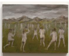
Untitled, 2021 Oil on Wood 7 1/4" x 10" (18.5 x 25.5 cm) Signed and Dated Verso in Pencil RYT.22525