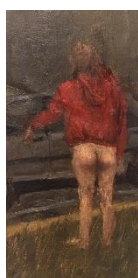
Untitled, 2020. Oil on Wood 7 1/8" x 3 1/2" (18 x 9 cm) RYT.22526d