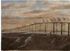
Untitled, 2020 Oil and Graphite on Canvas 29 1/4" x 40" (74 x 101.5) Signed and Dated Verso in Pencil RYT.22512