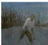
Untitled, 2019 Oil on Wood 5 3/4" x 6 1/4" (15 x 16 cm) Signed and Dated Verso in Ink RYT.22518