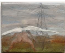
Untitled, 2020 Oil and Graphite on Wood 3 1/2" x 4 3/8" (9 x 11 cm) Signed and Dated Verso in Pencil RYT.22529