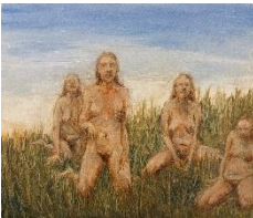
Untitled, 2021 Oil on Wood 7.5" x 9" (19 x 23 cm) Signed and Dated Verso in Pencil RYT.22602d