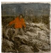
Untitled, 2019 Oil on Canvas Approximately 32" x 32" (81.5 x 81.5 cm) Signed and Dated Verso in Pencil RYT.22504