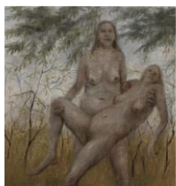
Untitled, 2020 Oil on Wood 9 7/8" x 9 1/4" (25 x 23.5 cm) Signed and Dated Verso in Pencil RYT.22523