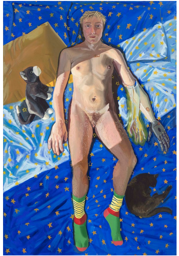
"Bed of Stars: Self Portrait with Elsinia and Zip" (2021).