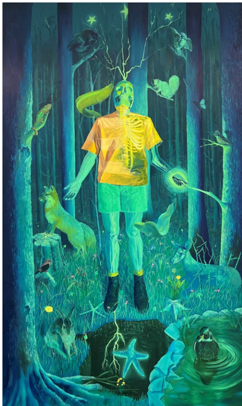
"I Sing the Body Electric" (2022).