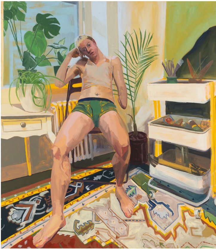
"self portrait in my studio" (2020).