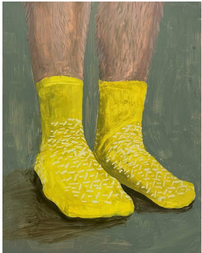
"Sunshine Socks" (2022).