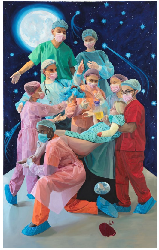
"Autotomy in the Liminal Realm: Splitting Time with a Scalpel" (2021).